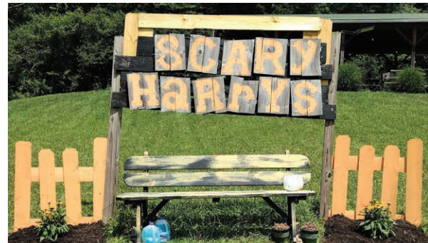
A YEAR-ROUND PROJECT: Before the Scary Harry's Haunted Trails opens mid-September for the spooky season, staff work throughout the summer to prepare the attraction.

atmospheric setting to its meticulously crafted scares and immersive storytelling, every aspect of this attraction is designed to leave a lasting impression on those brave enough to venture into its depths. As Halloween approaches, dare to step into the darkness and discover why Scary Harry's is a destination that continues to captivate and terrify all who dare to visit. 🎃